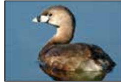
Pied Billed Grebe