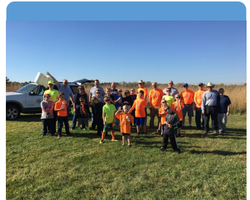
Boy Scout Pack 38 and their families from Elgin helped harvest seeds at the Burnidge workday on Oct 21st.

Nov 18 from 9 a.m. to noon Dec 16 from 9 a.m. to noon Jan 20 from 9 a.m. to noon