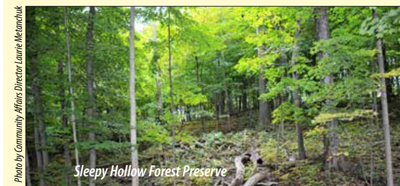
Sleepy Hollow Forest Preserve