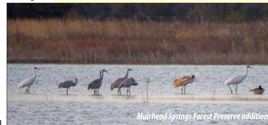
Muirhead Springs Forest Preserve addition