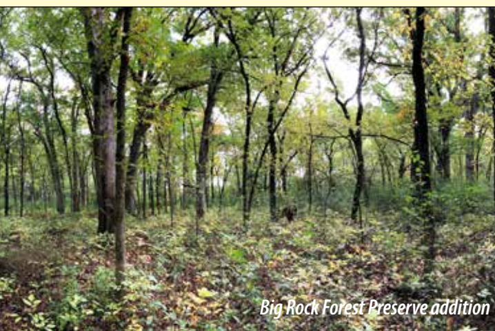
Big Rock Forest Preserve addition